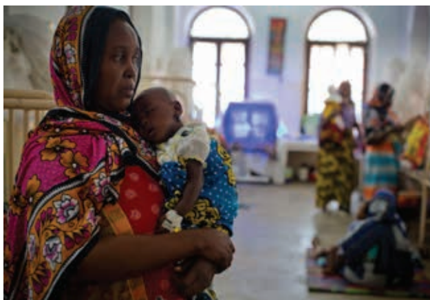
Photo: Women hold their babies in the paediatric unit of the regional hospital in Zanzibar, Tanzania in April 2014.