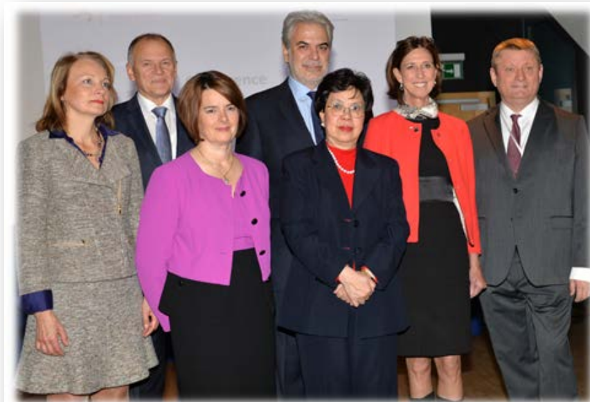
Conference "lessons learned for public health from the Ebola outbreak in West Africa – how to improve preparedness and response in the EU for future outbreaks" - Mondorf les Bains, 12-14 October 2015

http://ec.europa.eu/health/preparedness_response/events/ev_20151012_en.htm#c